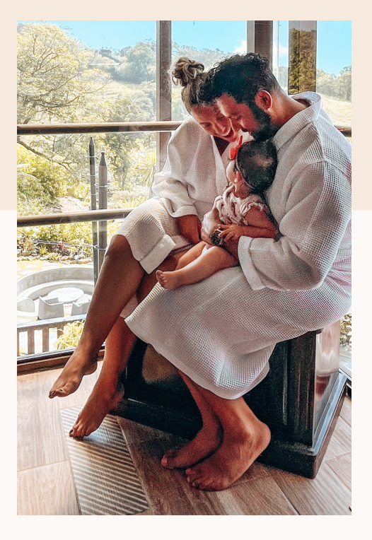
Taken at Poco a Poco Hotel & Spa Monteverde, Costa Rica