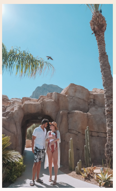
Taken at Hilton El Conquistador Resort Tucson, AZ