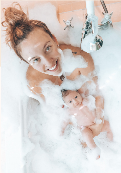
Taken at the Hotel ICON, Autograph Collection Houston, TX