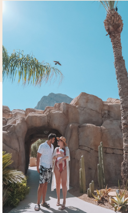
Taken at Hilton El Conquistador Resort Tucson, AZ