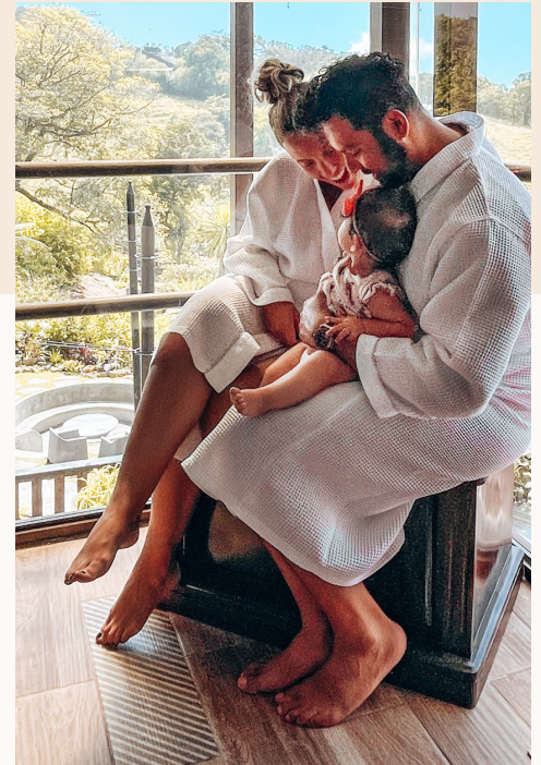
Taken at Poco a Poco Hotel & Spa Monteverde, Costa Rica